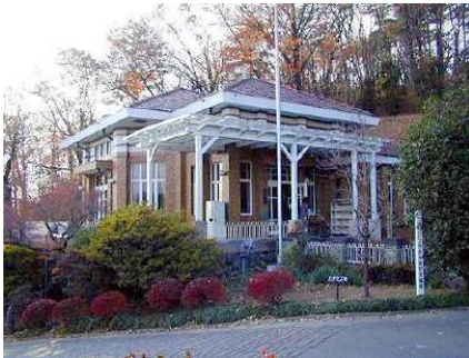
Suidoyama Memorial Hall

Toyoko Inn Kiryu-eki Minami-guchi (The meeting place, 10:00) = 杖=Suidoyama Memorial Hall=杖 = Azuma Parking Area (10 minutes break) = 杖 Hiking (Going up 90 minutes) 杖 = Get to the top [Lunch time] = 杖 Go down a mountain 杖 = Kiryu Zoo(1 hour) = 杖 = Yurinkanmae bus stop = 杖 = Toyoko Inn Kiryu-eki Minami-guchi (Breakup)